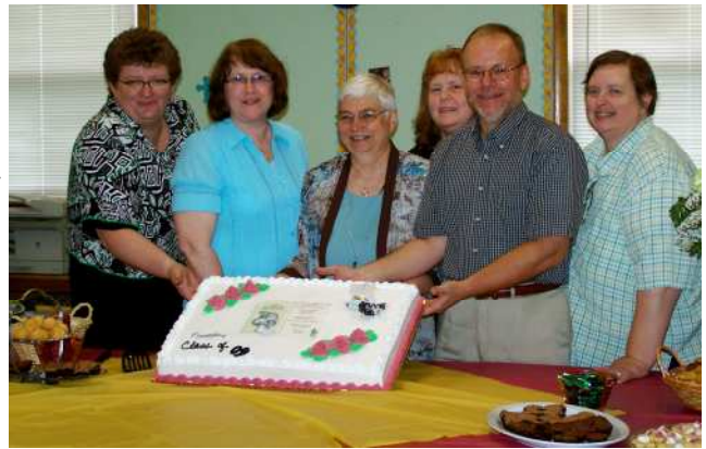
Class of 2009

All of the graduates thought the LIMEX experience was life changing. Some of their reflections on the program are: